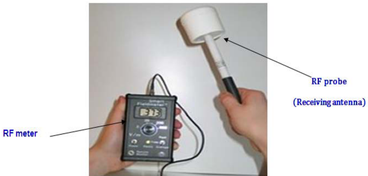
Figure 4.2 Portable RF survey meter

A standard RF survey meter is basically a combination of a receiving antenna (probe) and a meter.